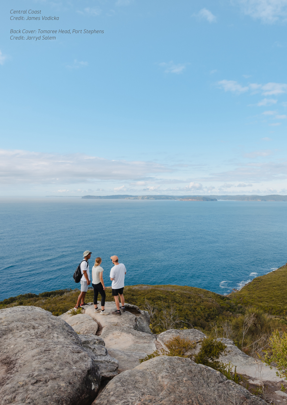
Central Coast Back Cover: Tomaree Head, Port Stephens