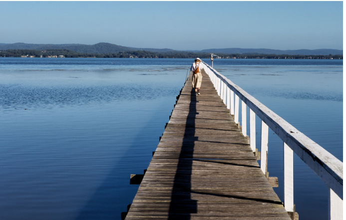
Long Jetty