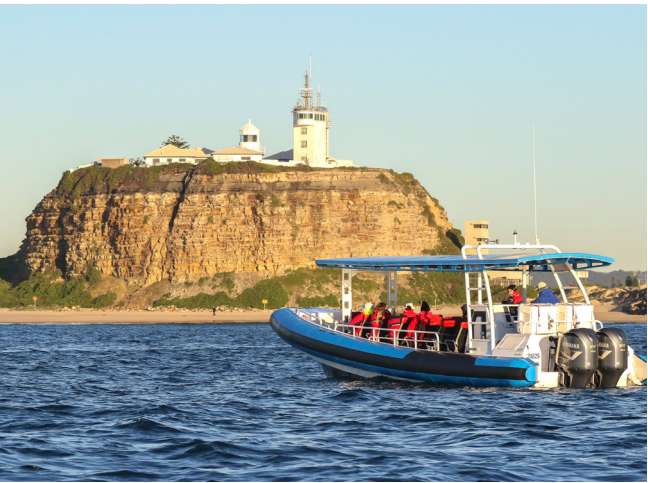
Coast XP Tours, Newcastle

For more information: W: visitnewcastle.com.au E: visitorinformation@ncc.nsw.gov.au Shore excursion information: cruise@dssn.com.au