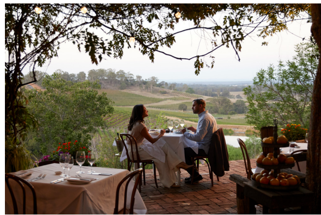
Bistro Molines, Mount View