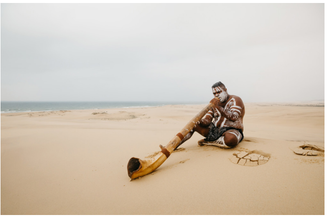
Stockton Dunes