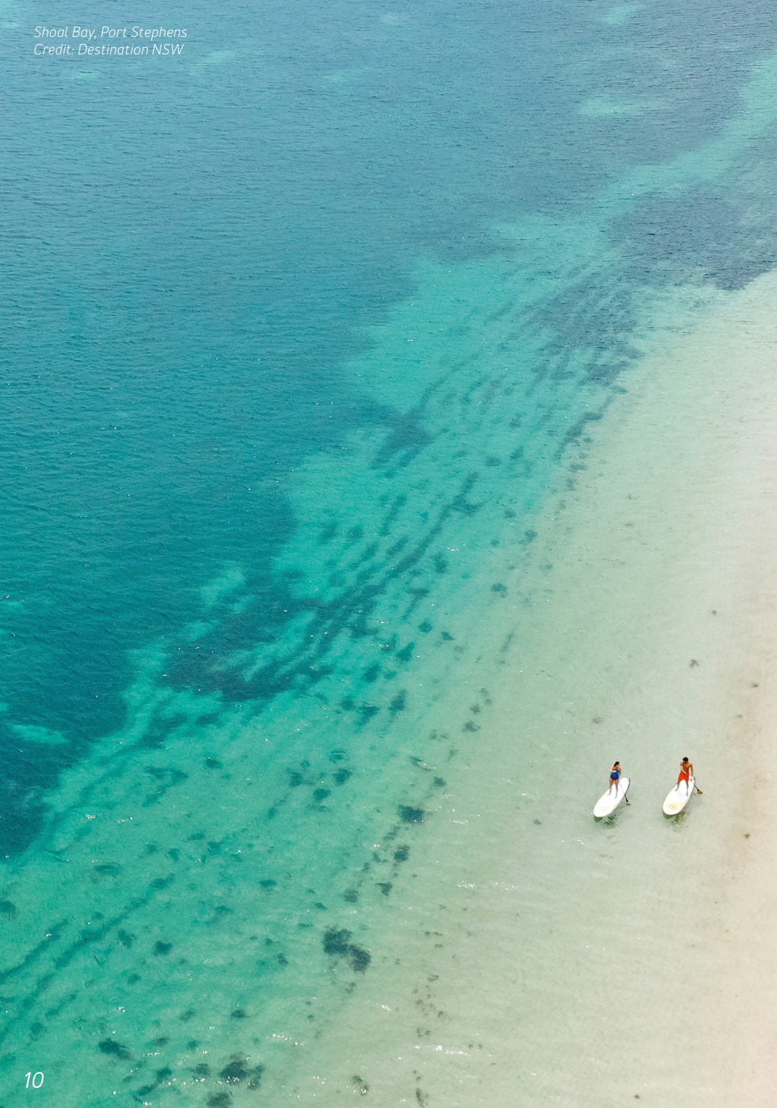
Shoal Bay, Port Stephens