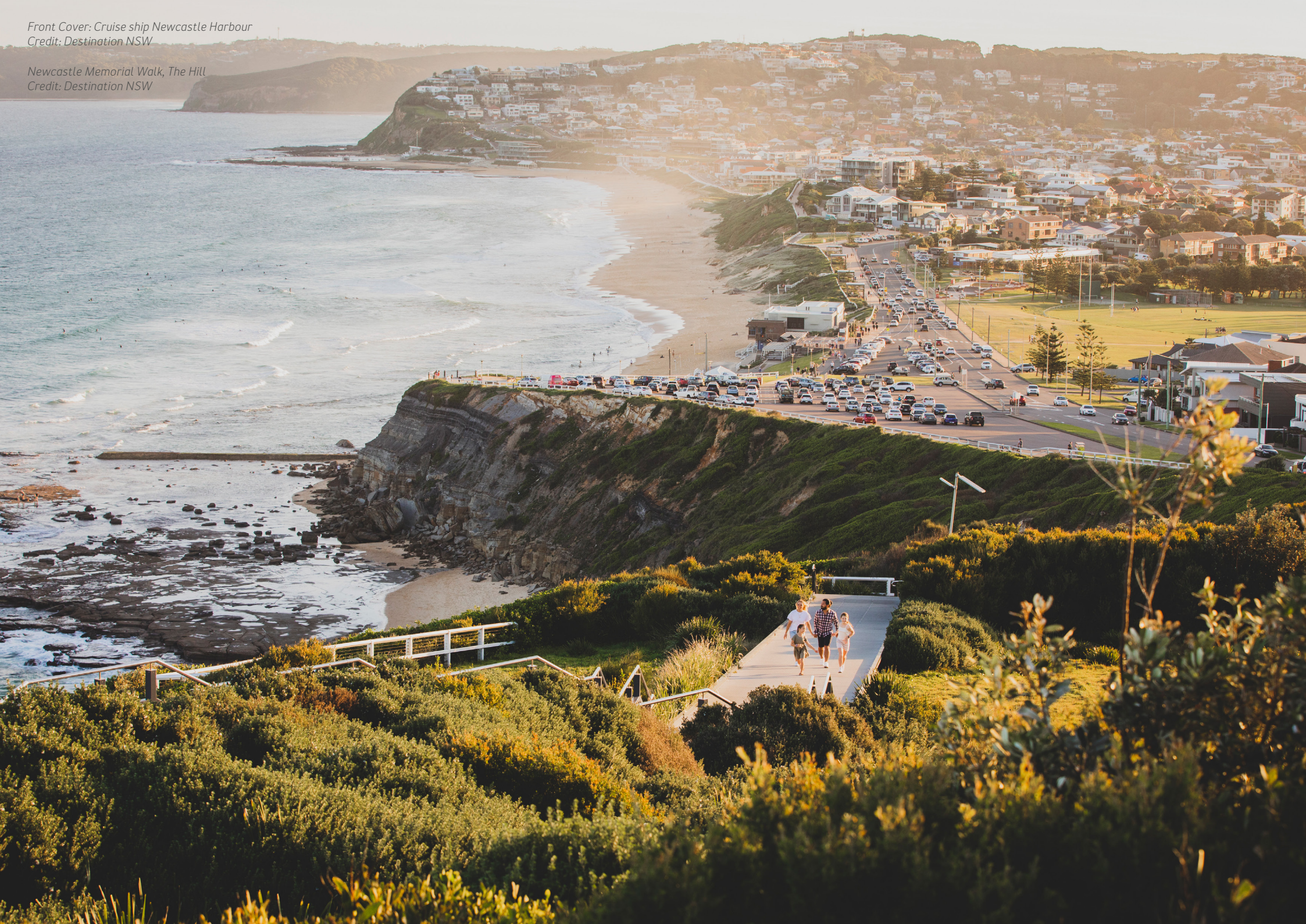
Front Cover: Cruise ship Newcastle Harbour