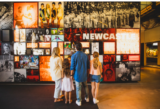
Newcastle Museum