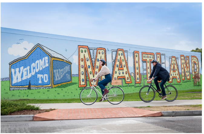
Streetscapes, Maitland