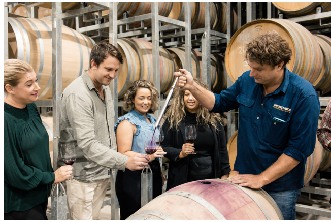
Brokenwood Winery, Pokolbin