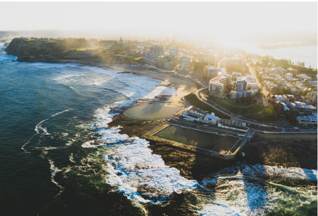
Newcastle Beach