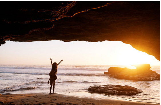
Caves Beach, Lake Macquarie