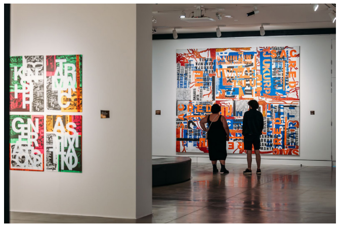
Maitland Regional Art Gallery