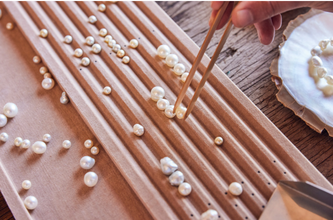
Broken Bay Pearl Farm, Mooney Mooney