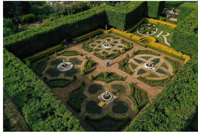
Hunter Valley Gardens - Credit: Destination NSW