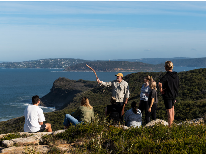
Girri Girra, Bouddi National Park