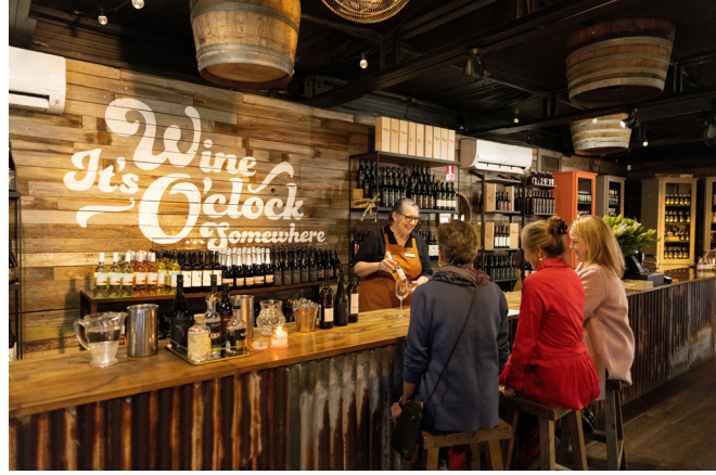
B Farm by Murrays