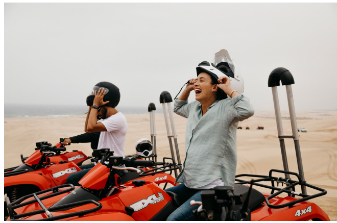
Stockton Sand Dunes in the Worimi Conservation Lands - Credit: Destination NSW

For more information: W: portstephens.org.au E: info@portstephenstourism.com.au Shore excursion information: cruise@dssn.com.au