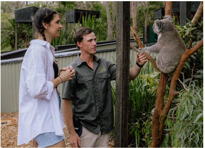
Australian Reptile Park

For more information: W: LoveCentralCoast.com or E: tourism@centralcoast.nsw.gov.au Shore excursion information: cruise@dssn.com.au