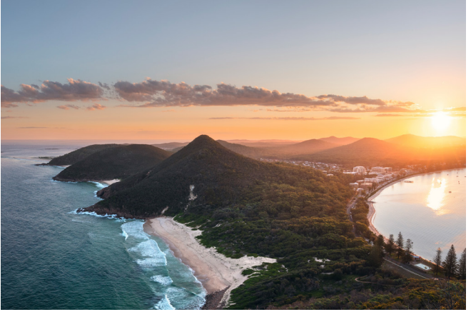
Tomaree Head Summit