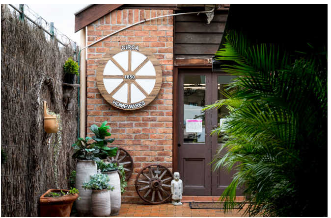
Crica 1950 Homewares, Morpeth