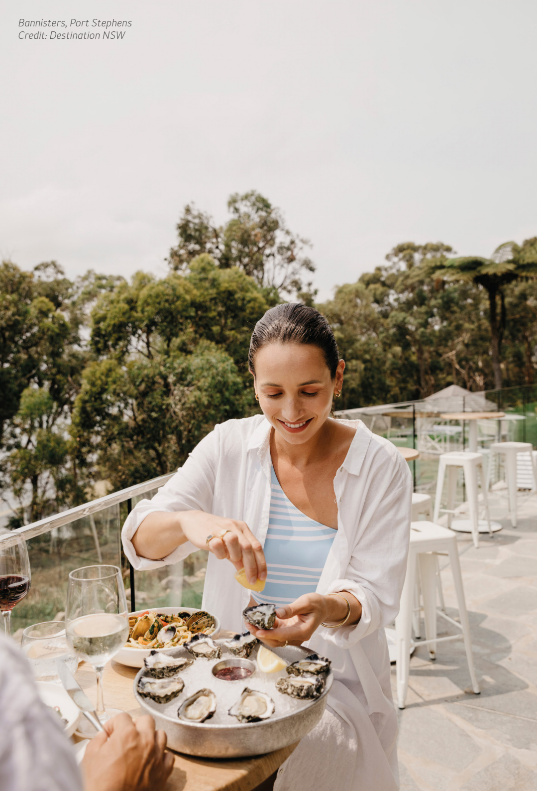
Bannisters, Port Stephens