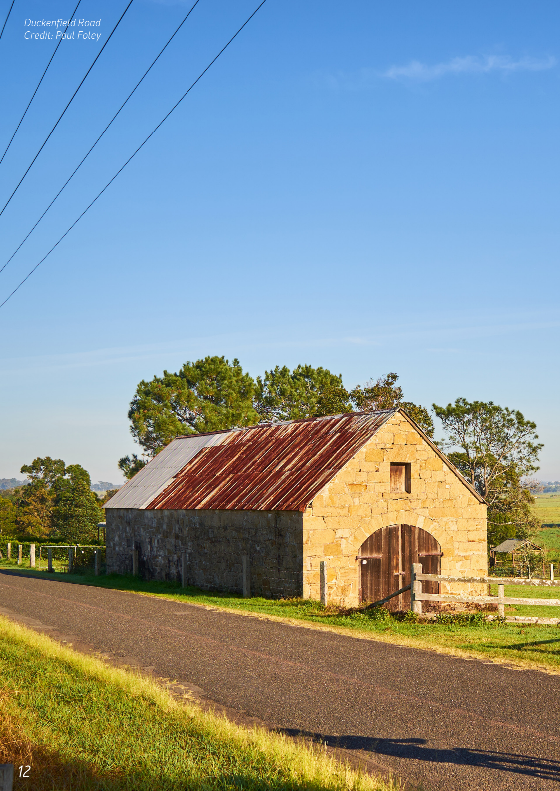
Duckenfield Road