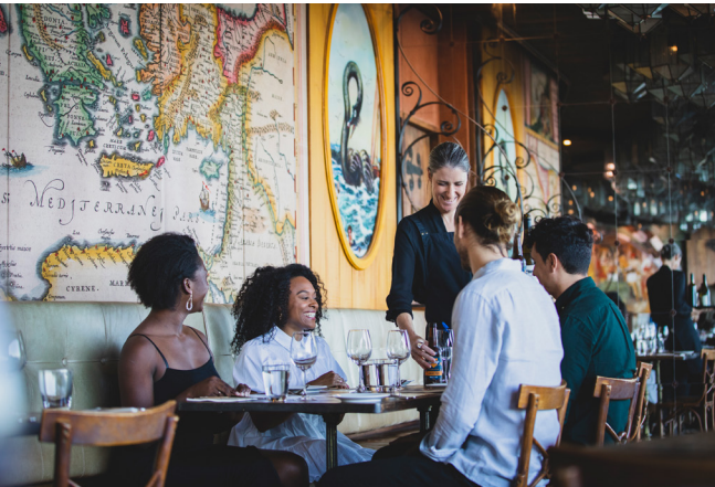
Rustica, Newcastle