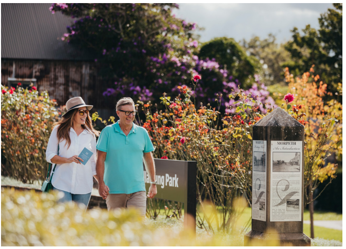
Illalung Park, Morpeth