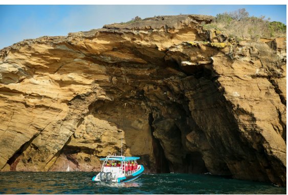
Coast XP, Lake Macquarie