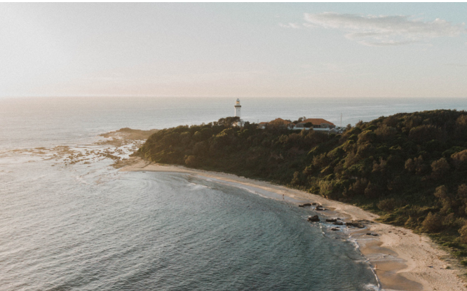
Norah Head Lighthouse