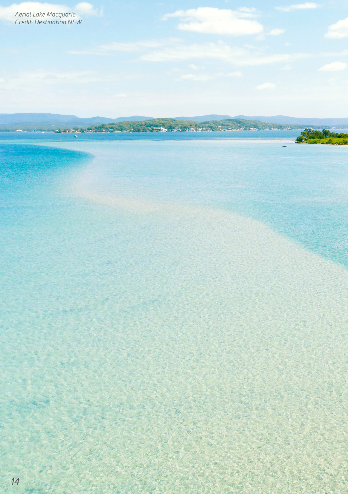
Aerial Lake Macquarie