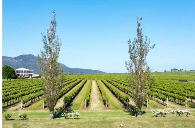
Hunter Valley Vineyards