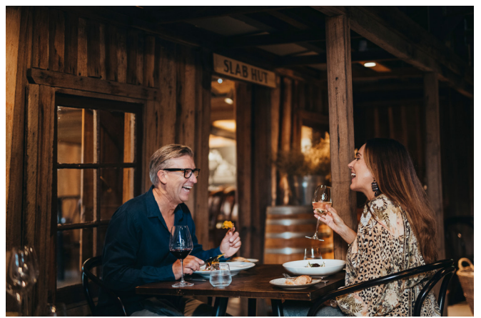
Boydell's, Morpeth