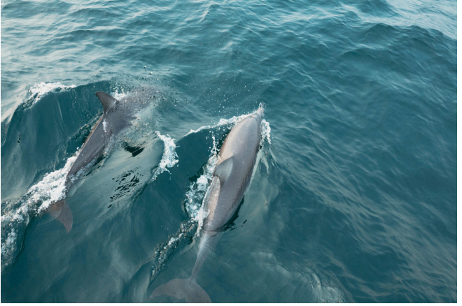
Dolphins, Port Stephens