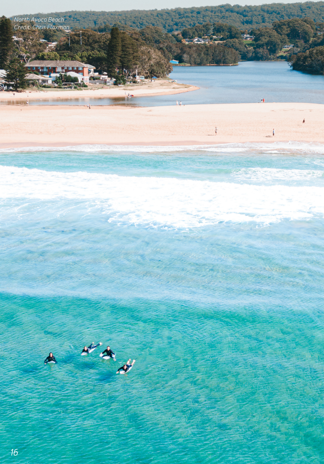
North Avoca Beach