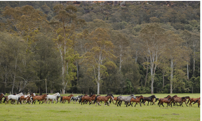
Glenworth Valley