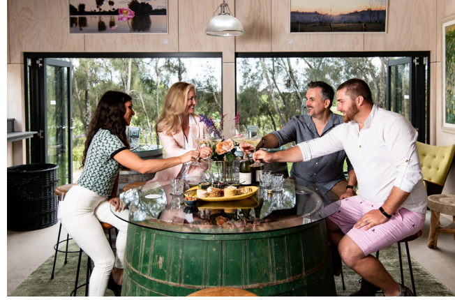
Winmark Wines, Broke

For more information: W: winecountry.com.au E: info@winecountry.com.au Shore excursion information: cruise@dssn.com.au