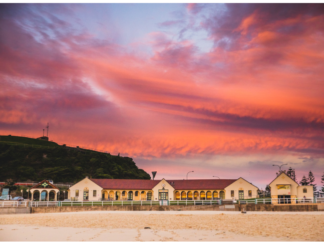
Nobbys Beach, Newcastle