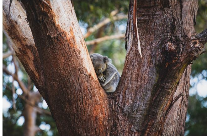
Port Stephens Koala Sanctuary