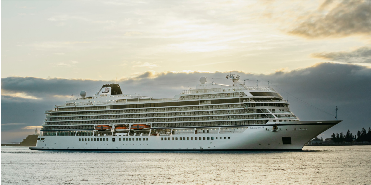
Cruise ship Newcastle Harbour