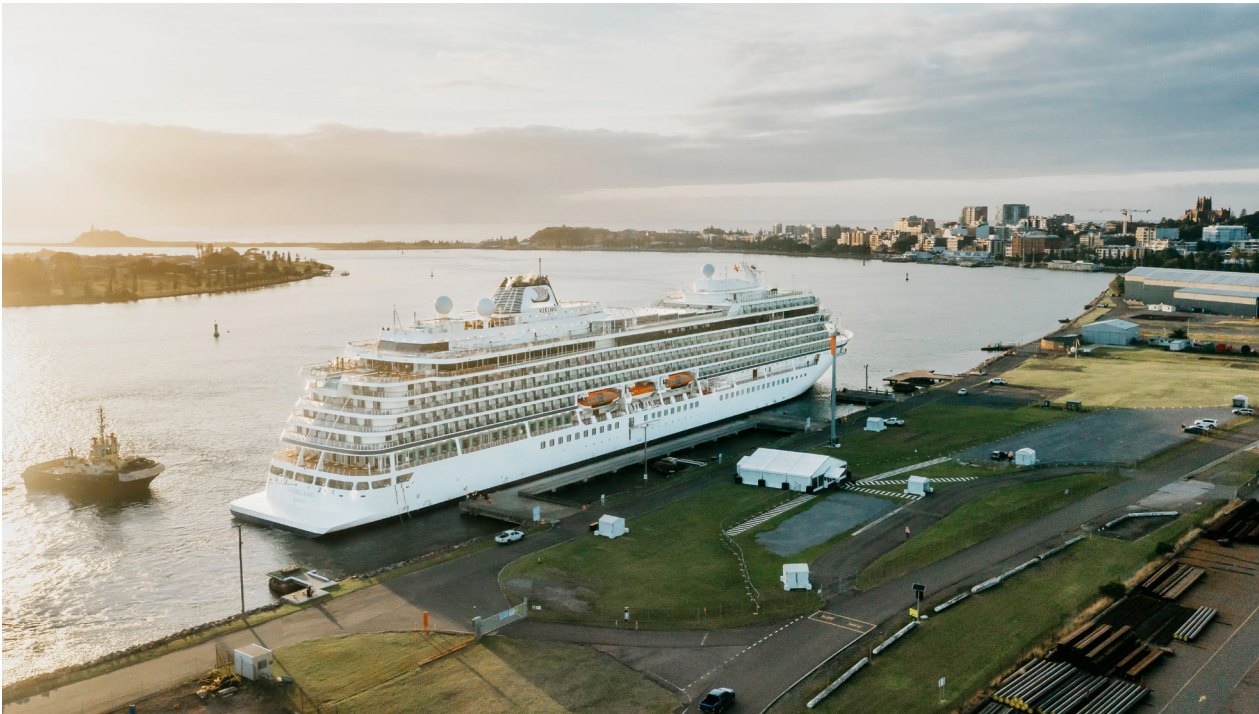
Cruise ship docked at the Newcastle Harbour