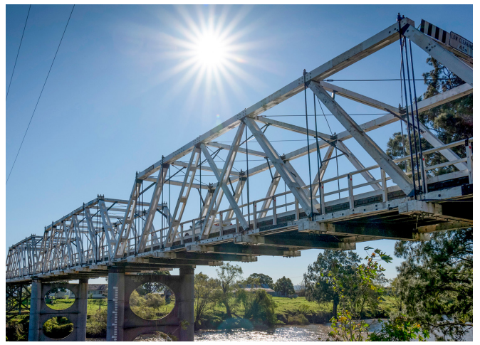
Morpeth Bridge

For more information W: mymaitland.com.au E: welcome@mymaitland.com.au Shore excursion information: cruise@dssn.com.au