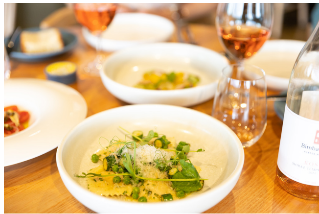
Esca Restaurant, Bimbadgen, Pokolbin