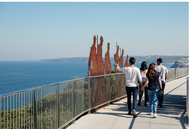
Newcastle Memorial Walk