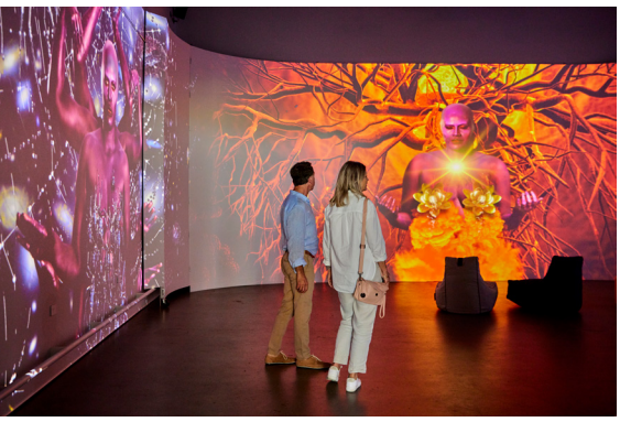
Multi-Arts Pavilion (Map mima), Lake Macquarie