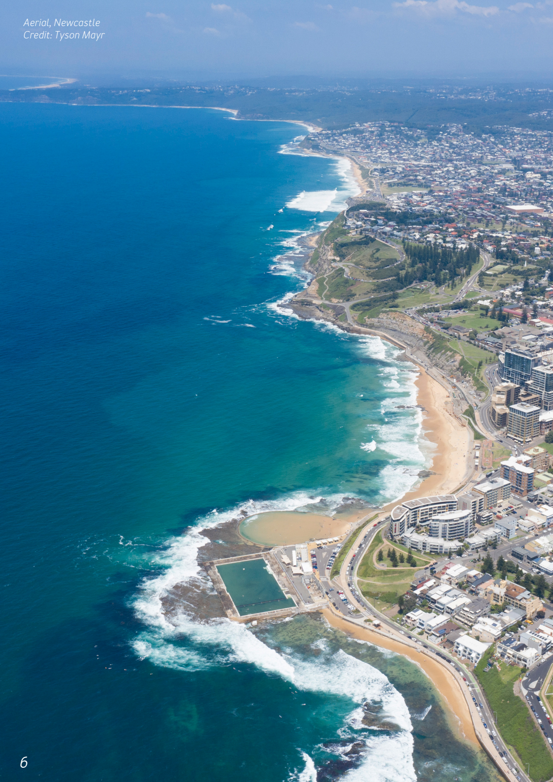
Aerial, Newcastle